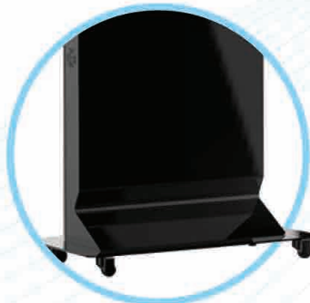
Wheels for Relocation*