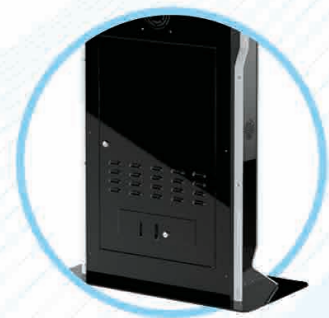
Internal Space for NUC or Media Player