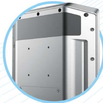
SUS 304 Stainless Steel Chassis