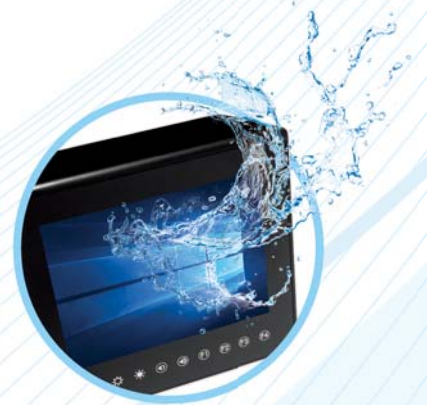
IP66 Water & Dust Resistance