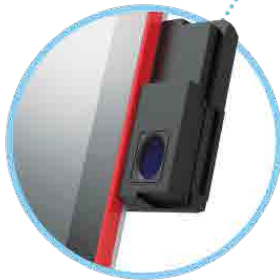
MSR / Fingerprint / RFID Reader