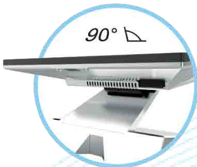
90 Degree Panel Tilt