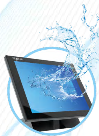
IP54 Whole Unit