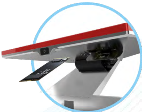
2 x Removable M.2 SSD