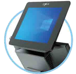
Upward* / Downward Customer Display