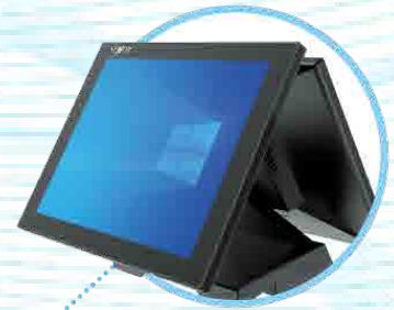
9.7" / 15" Customer Display