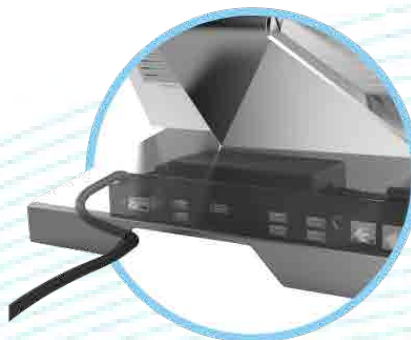
Internal Power Supply Cable Management System