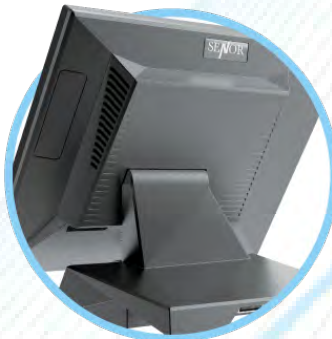
Fanless & Screwless