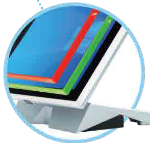
Coloured Frame* / Housing*