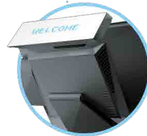
VFD Customer Display