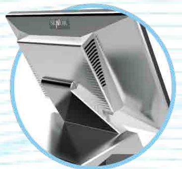
Fanless / Screwless