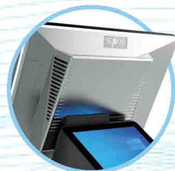
Fanless / Screwless