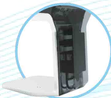
Internal Power Supply