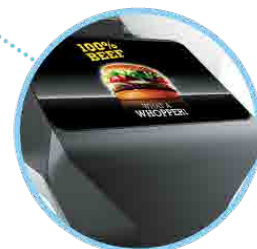
7" LCD / Customised Logo