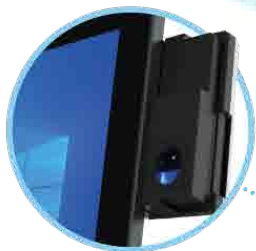
MSR / Fingerprint / RFID Reader