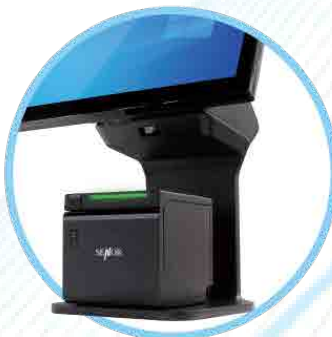
Integrated Peripheral Space-saving