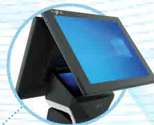
VFD / 10" / 15" Customer Display