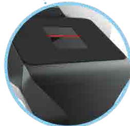
2D Barcode Scanner / RFID (NFC)