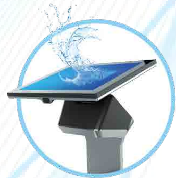
IP54 Whole Unit (Without Peripherals)