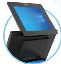
Upward* / Downward Customer Display